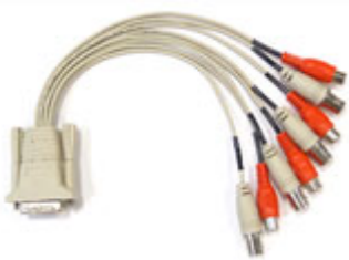
4 cam video cable