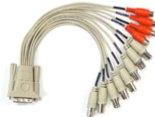
8 cam video cable